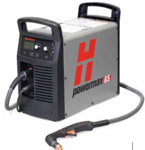
Duramax torch styles